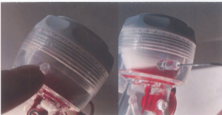
Photo of blocked manometer port

The preliminary root cause investigation for the blocked manometer port identified manufacturing problem (molding tool problem). The root case will be further investigated and documented in CA-000948. The damaged molding tool has been repaired and a delivery stop has been initiated for the affected items.