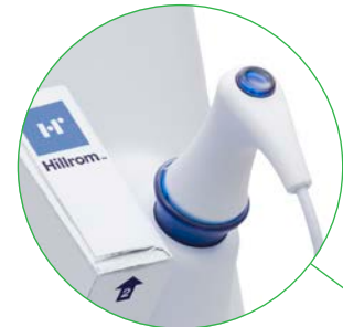
All-In-One Vitals Capture