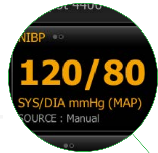
Easy to Navigate, Easy to Use

Save time and help reduce data entry errors by sending patient data to the EMR.