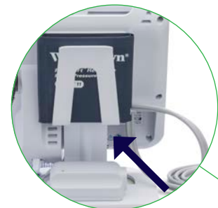
EMR Connectivity via USB Cable