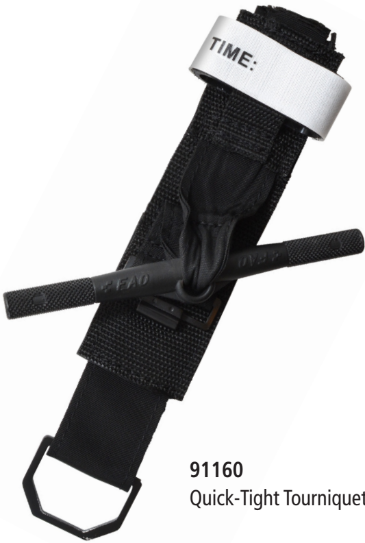
91160 Quick-Tight Tourniquet